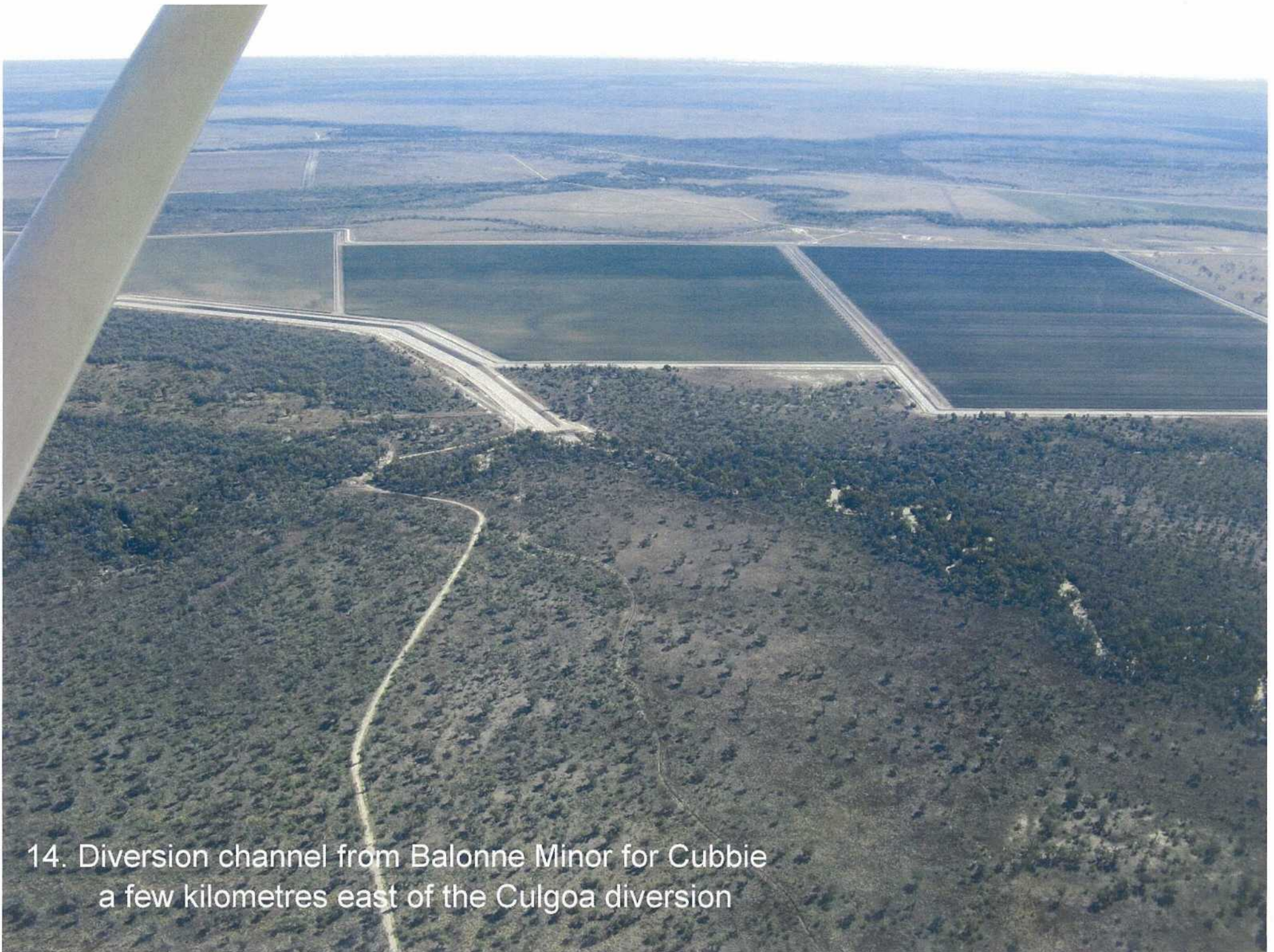
14. Diversion channel from Balonne Minor for Cubbie a few kilometres east of the Culgoa diversion