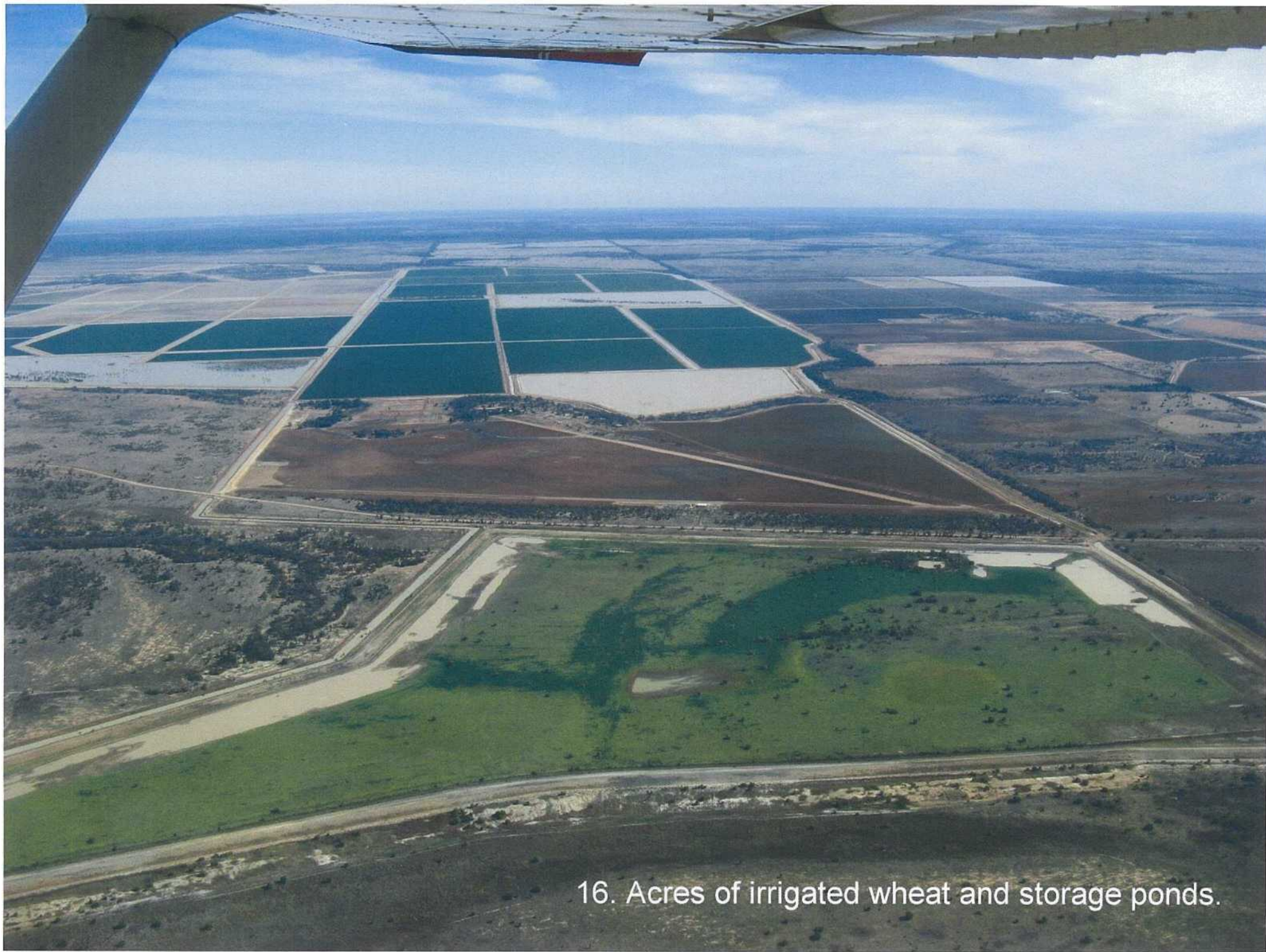
16. Acres of irrigated wheat and storage ponds.