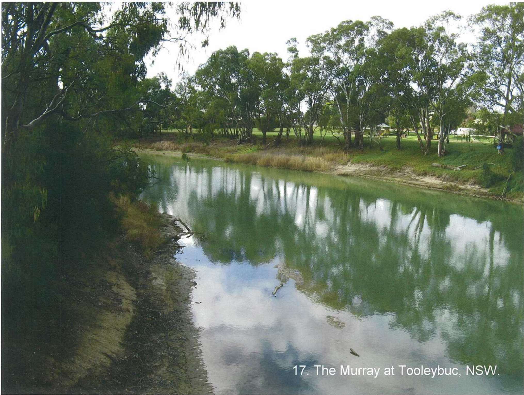
17. The Murray at Tooleybuc, NSW.