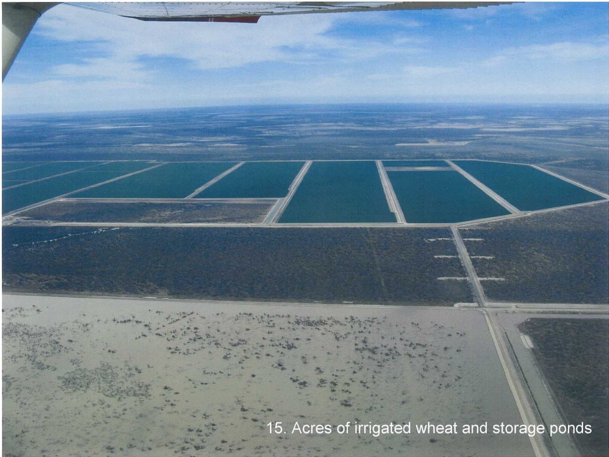
15. Acres of irrigated wheat and storage ponds